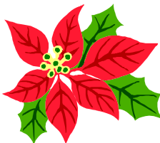
Women's Bazaar is Dec. 1st, 10-3PM.

If you have been unable to help in preparing for the bazaar, your chance to support it will be on Dec. 1st! Come and shop for many of your Christmas needs! Bring your friends and family. Some of the items offered for sale at the bazaar include: ornaments, crafts, baked goods, candies, pet treats, Christmas décor, and many items in their "granny's attic".